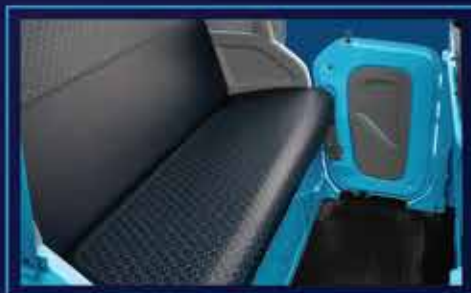
Dual Tone Seat With Premium Upholstery