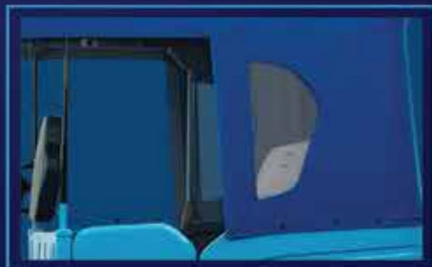
Side Visibility Window