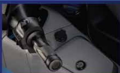
USB type A Charger