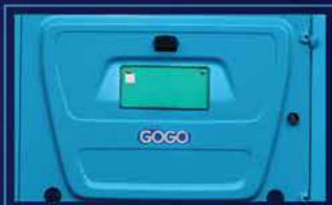
LED Tail Lamps & Number Plate Lamp