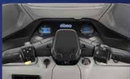
Digital Instrument Cluster (Battery %, Trip Meter, DTE...)