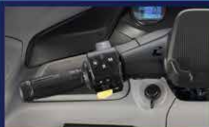
Multiple Drive Modes (Eco, Power, Climb & Park Assist)