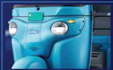
Stylish Front Fairing, 3 Mode LED Headlamps & Blinkers