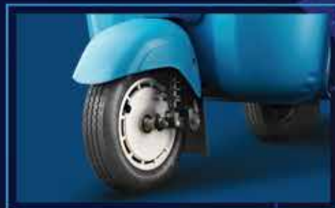
Stylish Wheel Caps