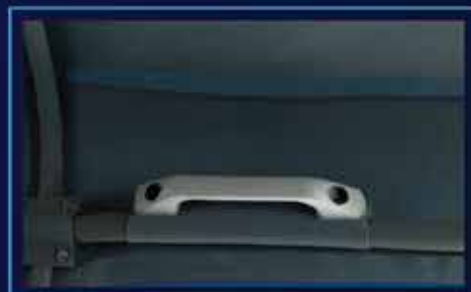
Car-Like Monotone Interiors & Grab Handles