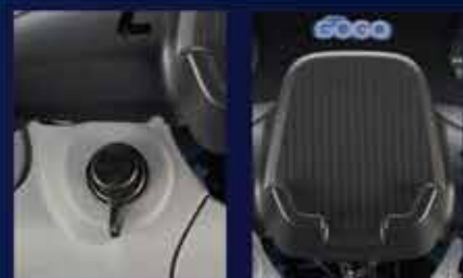
12V AUX Socket & Mobile Stand