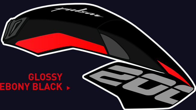
GLOSSY EBONY BLACK ▶