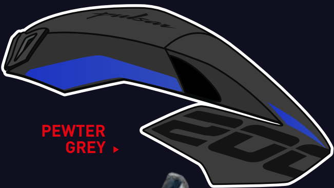
PEWTER GREY ▶