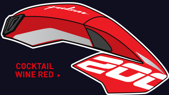
COCKTAIL WINE RED ▶