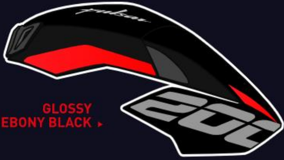
GLOSSY EBONY BLACK ▶