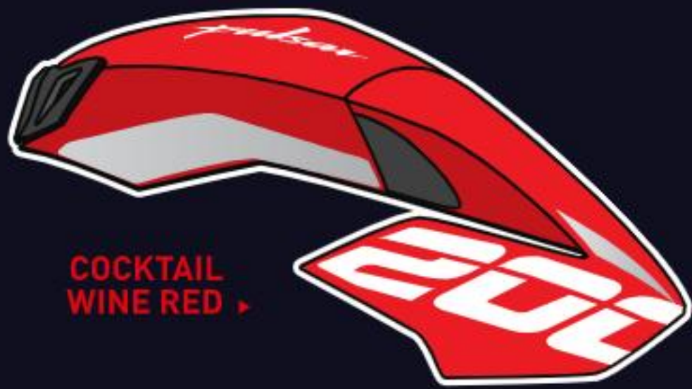
COCKTAIL WINE RED ▶