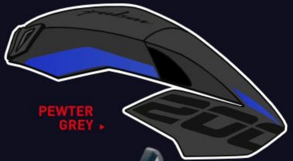
PEWTER GREY ▶