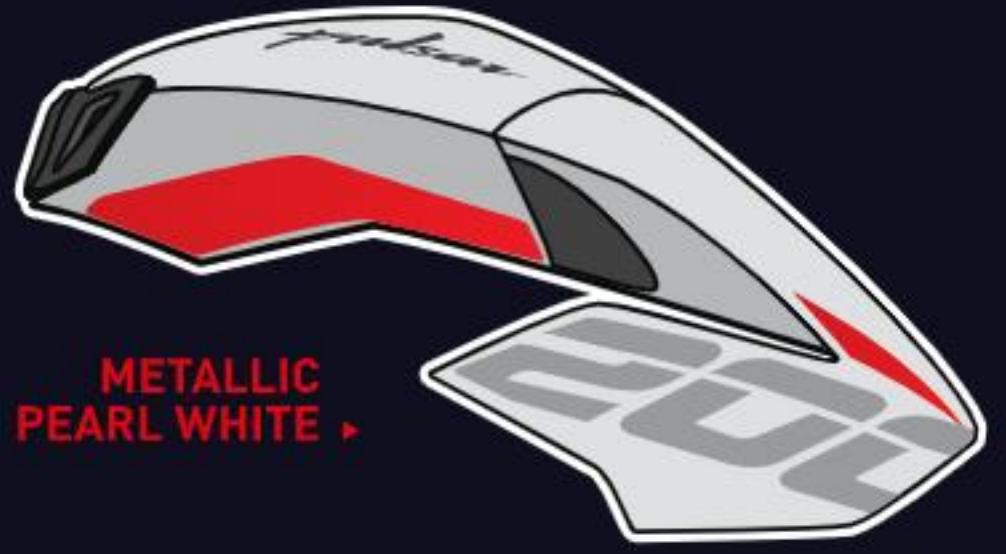
METALLIC PEARL WHITE ▶