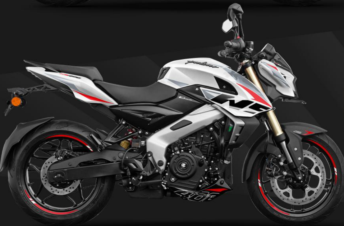
PEARL METALLIC WHITE