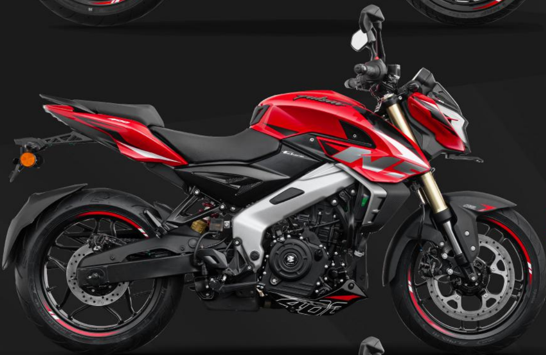
GLOSSY RACING RED