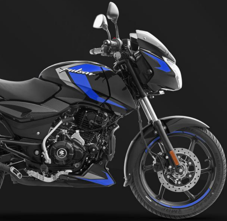
EBONY BLACK INK BLUE