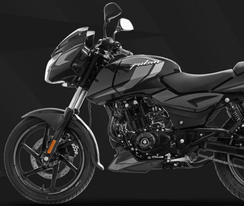
EBONY BLACK DARK GREY