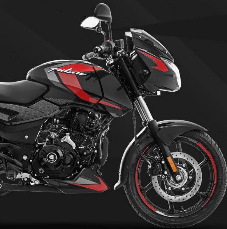
EBONY BLACK CHERRY RED