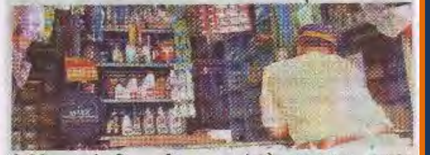
पोलीसे ग्रान्ट रोड विस्तारणी वार दुकानमां दरोडा पाड्या छता. - भास्कर