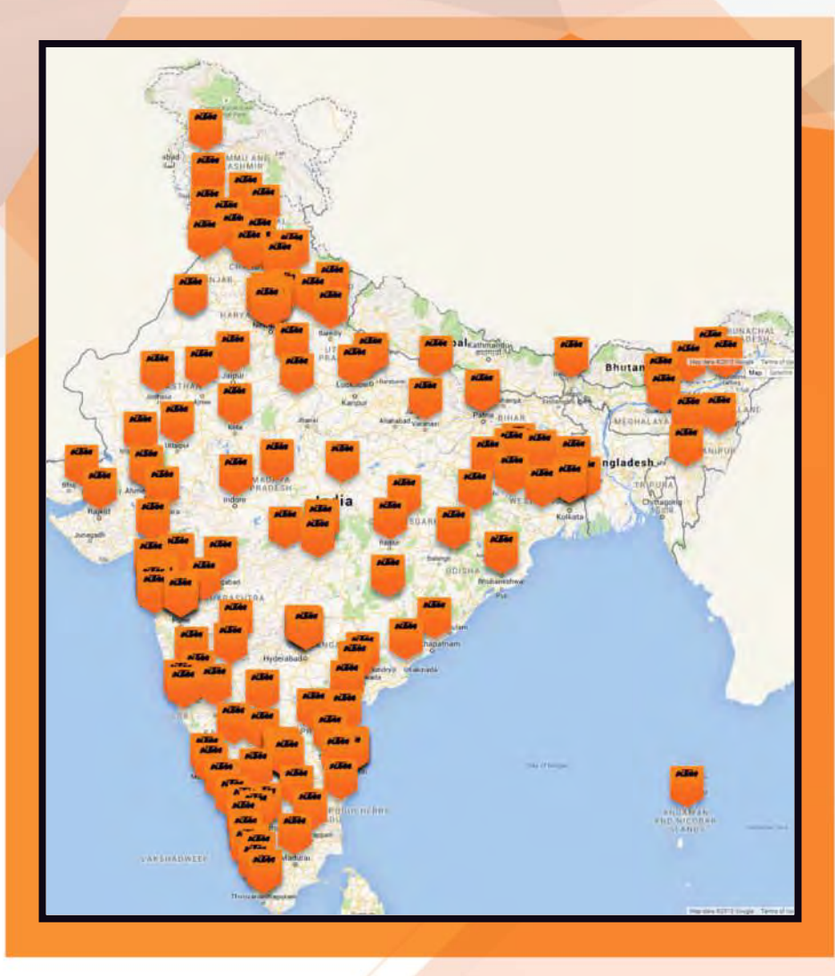
Exhibit 2: KTM's vast dealership network in India